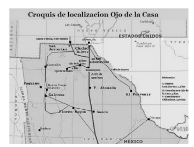
Figure 3. Ojos de Agua Locations

One of the characteristics of hiking is that walking is carried out on trails. A trail is an itinerary which has been designed on a geographic space where signals have been placed to guide the hiker while providing a series of supporting services such as restrooms, emergency stations, and information kiosks for the hiker. Flat trails, without much change in elevations, can be classified according to distance travelled. This holds from those that require little effort and can be completed within two hours (10 km) to physically demanding ones which take even more than eight hours to complete (Comité de Senderos de la Federación Española de Deportes de Montaña y Escalada). In this activity 5 km. intervals are being considered. This takes one hour to hike provided that the terrain is level as is the Samalayuca region. Another trail to be considered runs for about 10 km, starting at the town's exit and ending at the "Ojo Extremo" or "Ojo de la Punta". This would be the entire trail, but as it was mentioned before, there could be shorter alternatives with less kilometers. An example of this would be a trail starting at the "Ojo de la Casa" and ending at the "Ojo Extremo" or "Ojo de la Punta". This would mean this trail would be significantly less kilometers long. Figure 3 portrays the location of two springs or "ojos de agua".